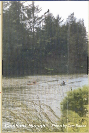
Coalbank Slough